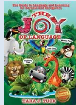
The Joy of Language is probably our most lively and colorful cover.

While it has been an amazing ride, we are surprised it is still not over. We thought we were retired when we moved to Hyde Park, but we recently finished designing four books, and we expect a few more projects to come in soon. You can see more of the Weems' work at http://www.thebookproducer.com . HP