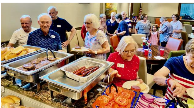
Hyde Park 4 th of July celebration at clubhouse

The Board gives homeowners updates during the Second Saturday Breakfast. Check the online calendar for dates. HP