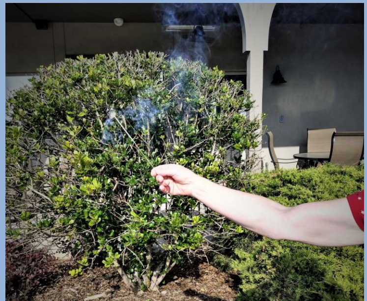
Fourth of July cookout/photo by Janice Holka.